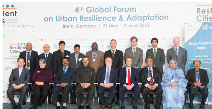
Durban Adaptation Charter signing ceremony at the Mayors Adaptation Forum

“Resilience requires very different planning to the planning your predecessors did 20 years ago... [and a] very very different set of policy measures.”