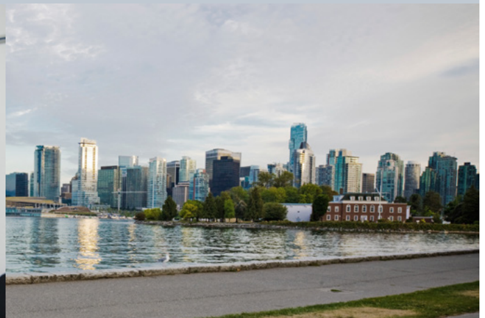
The City of Vancouver coastline