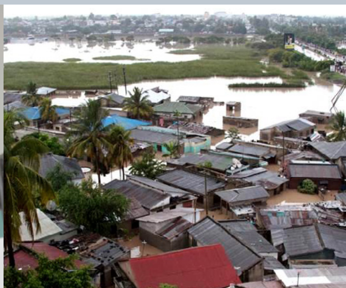
Flooding in high risk areas of Dar es Salaam, Tanzania

across multiple levels of local government. The result was improved living conditions, flood resilience, and property values in 31 communities.