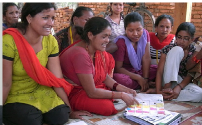
A community house design and settlement planning workshop in the Salyani community in Bharatpur, Nepal