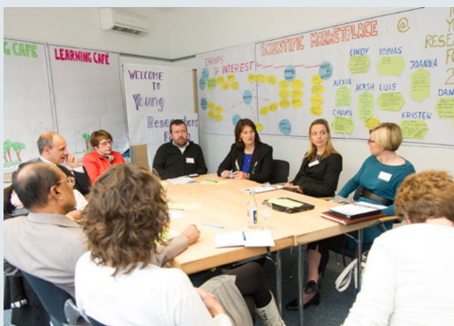
Discussion at the Young Researchers' Forum

International Urban Food Network (IUFN) presented its interactive, web-based platform on urban food governance. The platform is a center to analyze, produce, and share information between researchers and cities in industrialized countries and in Brazil, India, Russia and China.