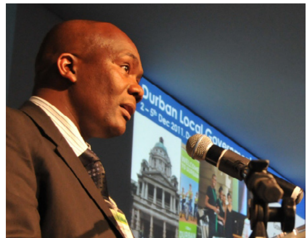
James Nxumalo, Mayor, City of Durban, South Africa; ICLEI's Vice President and portfolio holder for ICLEI's Resilient City agenda

ICLEI. A three day workshop in March 2013 was organized in Durban with the support of ICMA and USAID and in cooperation with IIED and MIT. Climate change adaptation leaders from selected local governments and experts identified the principles with which to translate the charter into an implementation path for local governments. The workshop results were shared in a special Mayors' session at Resilient Cities 2013 (see page 7).