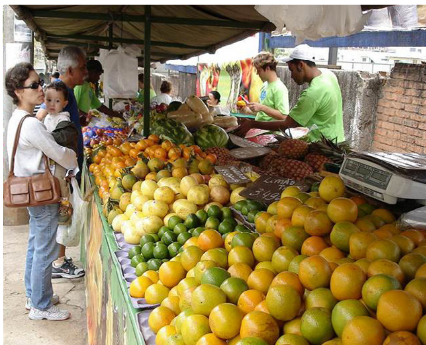
Food market in Belo Horizonte, Brazil